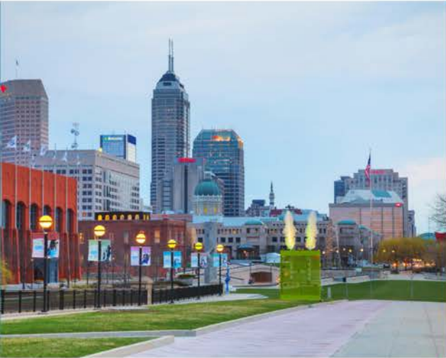
EXHIBIT HALL SCHEDULE